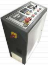
ELECTRIC CONTROL PANEL