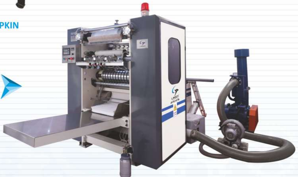
V-FOLD & N-FOLD TISSUE CONVERTING MACHINE