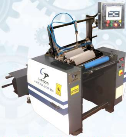
BUTTER PAPER REWINDING MACHINE