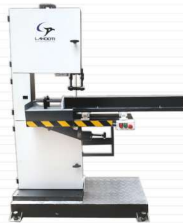
TOILET ROLL SLICER