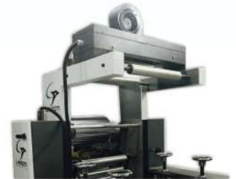
IR DRYER FOR HIGH PRODUCTION IN PRINTING