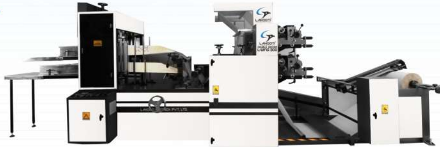
DOUBLE DECKER PAPER NAPKIN MACHINE