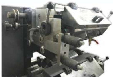
NAPKIN MACHINE PRINTING UNIT