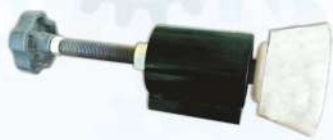
BLADE SHARPENING WHEEL