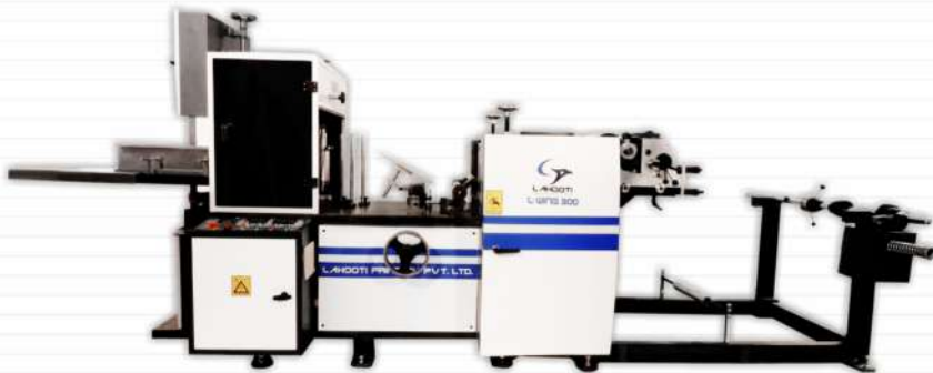
SINGLE COLOR SINGLE EMOSE PAPER NAPKIN MACHINE