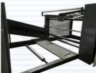
CHECKERED PLATE STAND