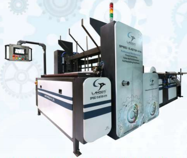
FULLY AUTOMATIC TOILET ROLL MAKING MACHINE