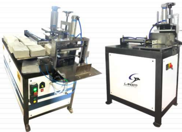
SEMI AUTOMATIC PAPER NAPKIN PACKING MACHINES