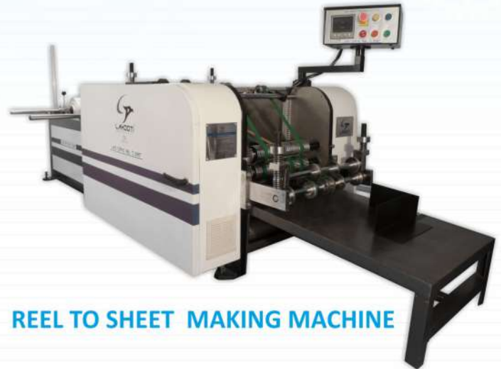
REEL TO SHEET MAKING MACHINE