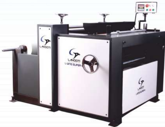
SEMI AUTOMATIC TOILET ROLL MAKING MACHINE