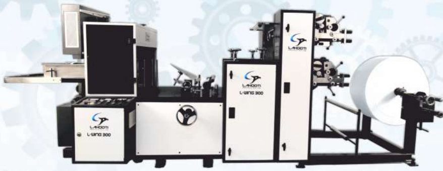
DOUBLE COLOR DOUBLE EMOSE PAPER NAPKIN MACHINE