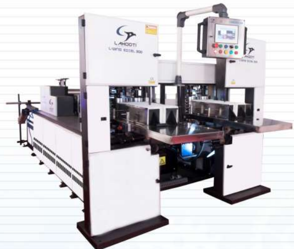
DOUBLE DECKER PAPER NAPKIN MACHINE (HORIZONTAL TYPE)