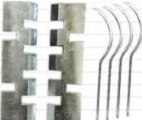
PAPER CATCHER & DRUM FINGERS